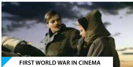
FIRST WORLD WAR IN CINEMA

Song lyrics will be projected onto the screen - join in with the fun!