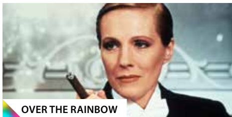
OVER THE RAINBOW